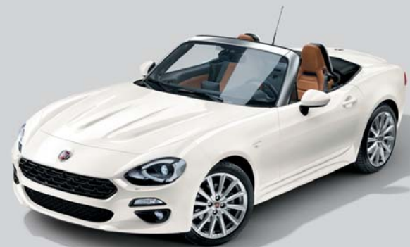
124 SPIDER LUSSO / LUSSO PLUS*

The new 124 Spider is equipped with 16" alloy wheels, electric mirrors in matching colour, steel double exhaust pipe, front pillar in body colour, black roll bars, fabric seats, leather steering wheel and gear knob, 4 airbags, power windows, manual climate control, Radio Pack - 7" touchscreen with multimedia control, DAB radio, Bluetooth®/WiFi - USB and AUX ports, cruise control and TPMS.