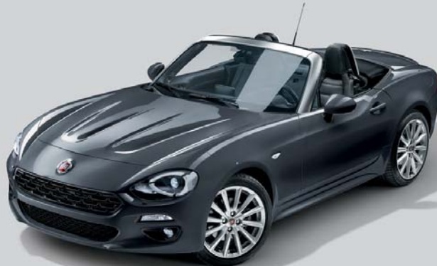
5CE FASHION GREY - METALLIC