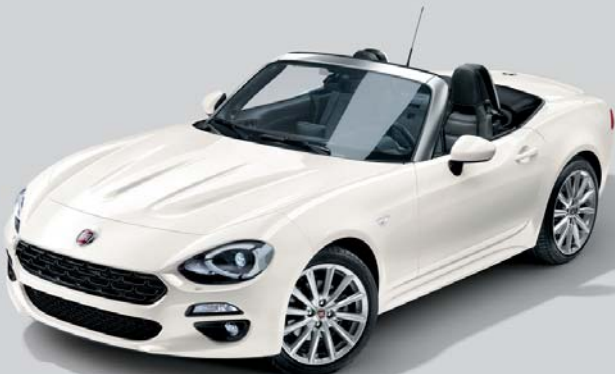
802 URBAN WHITE - THREE-LAYER