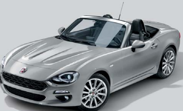
5CD ARGENTO GREY - METALLIC