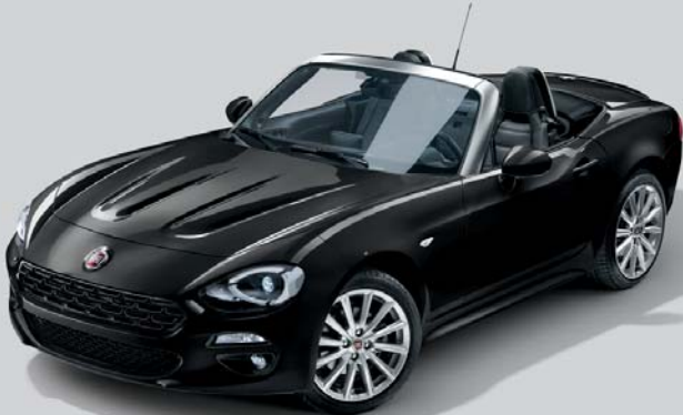
5DN VOLCANO BLACK - METALLIC