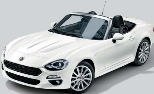
5CB ICE WHITE - PASTEL