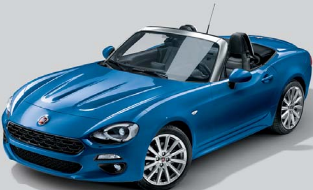
5CC ITALIA BLUE - METALLIC