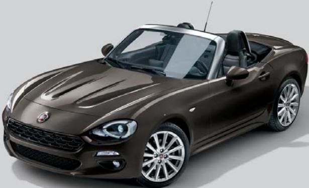
210 MAGNETIC BRONZE - METALLIC