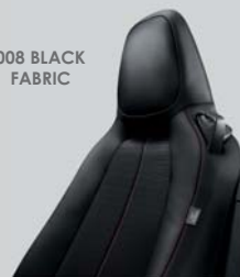
008 BLACK FABRIC