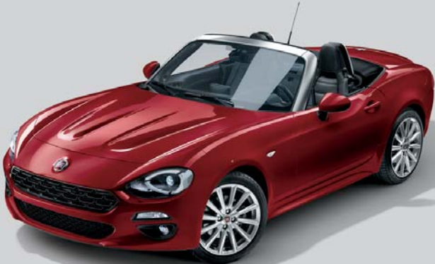
5CA PASSIONE RED - PASTEL